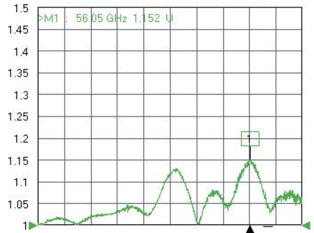
Tr2 S22 Refl SWR RefLvl: 1 U Res: 50 mU/Div