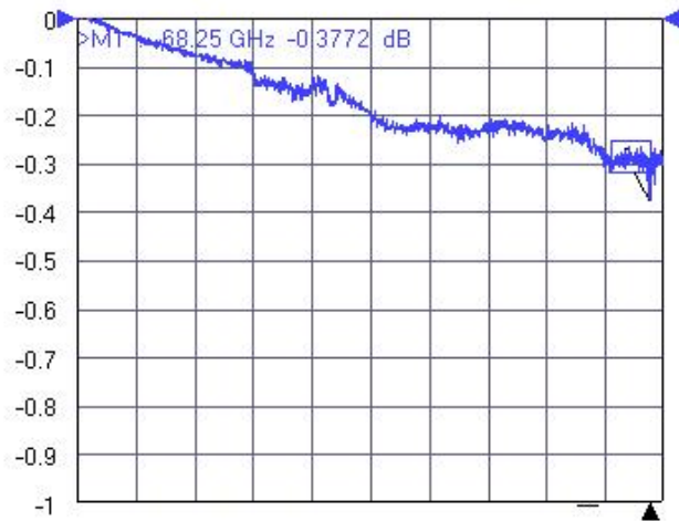
Tr3 S12 Trans LogM RefLvl: 0 dB Res: 0.1 dB/Div